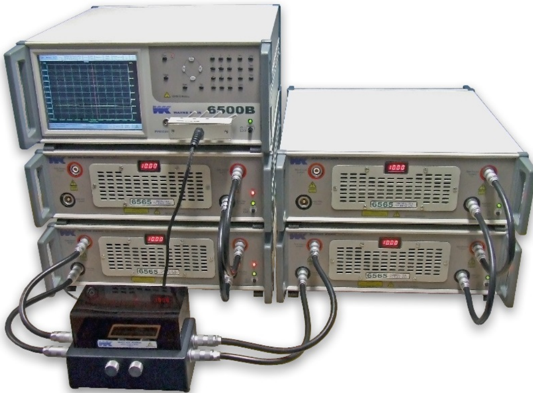
Typical 120 MHz 40 A DC Bias Current System (using 65120B, 4 x 6565-120 and 1027 Fixture)